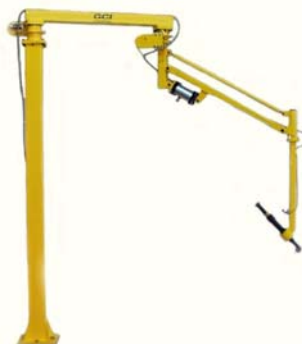
Rigid Torque Arms with Standard Capacities to 3000 Ft-Lbs (4000 Nm)