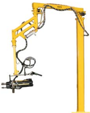
Multi-Spindle Rigid Tool Mounting for Arms or Torque Tube Systems