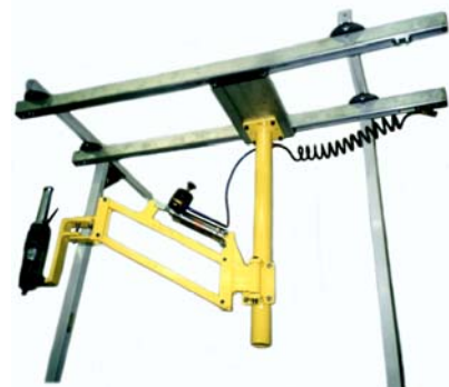
Overhead Rail Systems for Lightweight and High Torque Applications