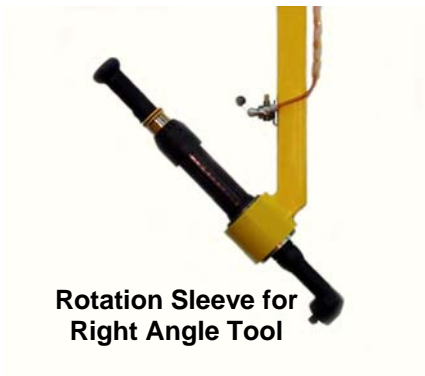
Rotation Sleeve for Right Angle Tool