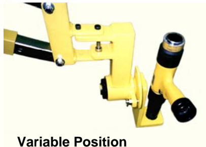
Variable Position Tool Mount