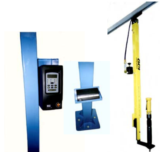
Controller and Socket Tray Mounting Remote Start Install